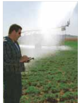
Remote end-guns are adjusted with Bluetooth® PDA

For more information, visit www.zimmatic.com or talk to your Zimmatic dealer.